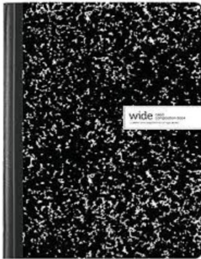
WIDE RULED COMPOSITION NOTEBOOK