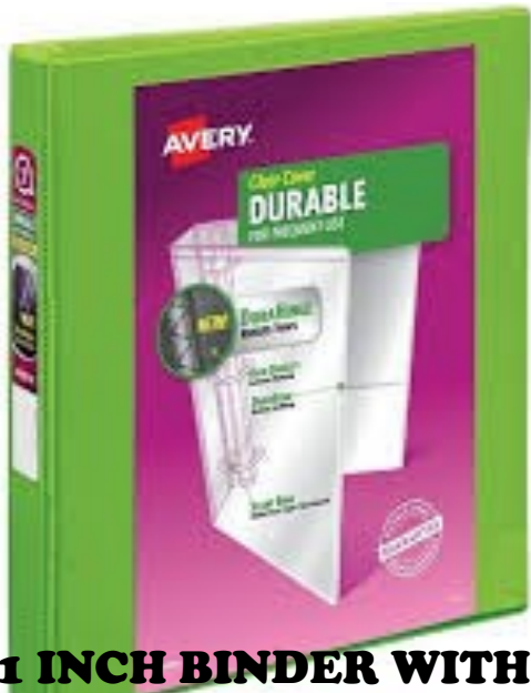
1 INCH BINDER WITH CLEAR FRONT POUCH