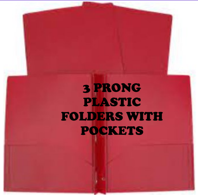
3 PRONG PLASTIC FOLDERS WITH POCKETS