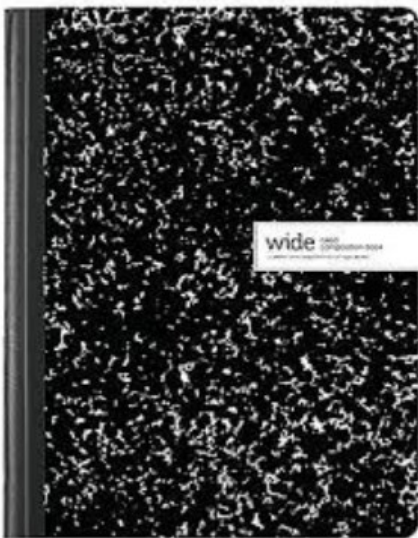
WIDE RULED COMPOSITION NOTEBOOK