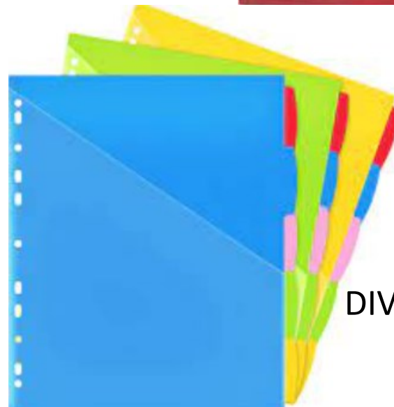
DIVIDERS WITH POCKETS