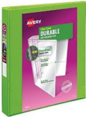
1 INCH BINDER WITH CLEAR FRONT POUCH